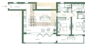
1st Floor Floorplan