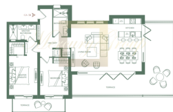
Ground Floor Floorplan