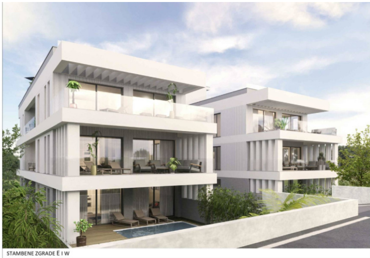
STAMBENE ZGRADE E I W